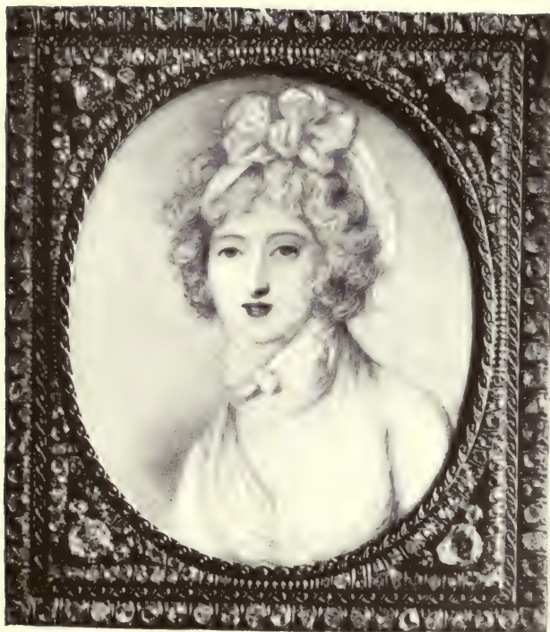
HENRIETTA, LADY DUNCANNON AFTERWARDS COUNTESS OF BESSBOROUGH (Ob. 1821) BY RICHARD COSWAY R.A.